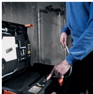
Automatic tightness test