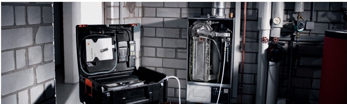
Automatic servicability test with gas-feed appliance with connection to the gas boiler