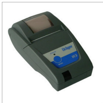
MSI IR3 infrared printer

Instantly documents all values and results