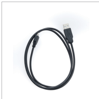
Micro USB cable