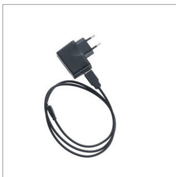
USB plug-in power supply unit, 100 V – 240 V