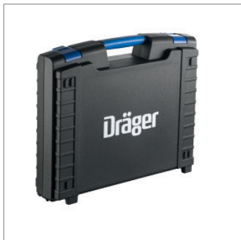
Equipment Case Heavy FG7500